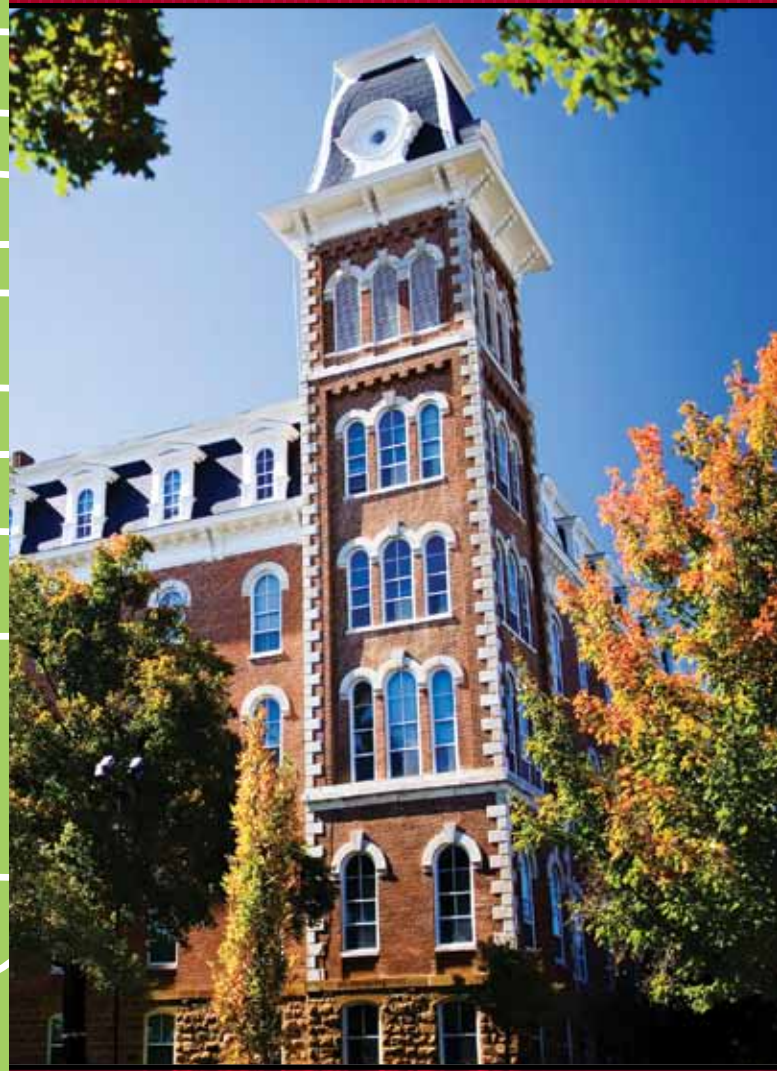
CITY HIGHLIGHTS BY CAR